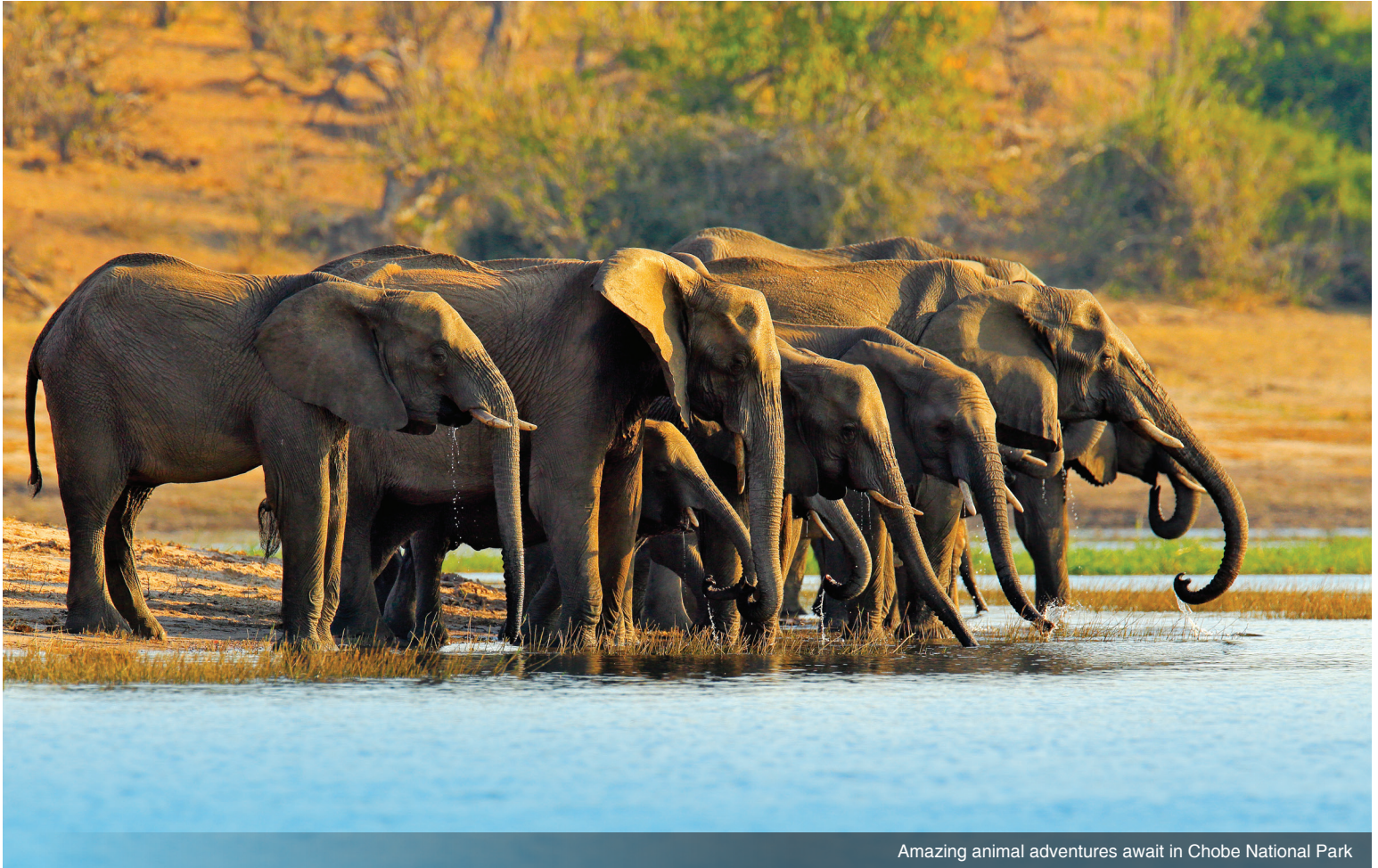
Amazing animal adventures await in Chobe National Park